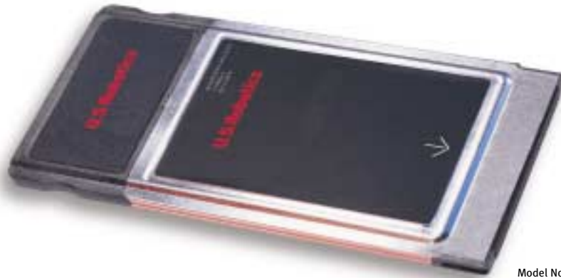
Model No. USR 012410