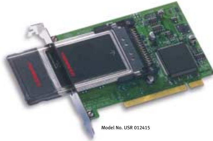
Model No. USR 012415