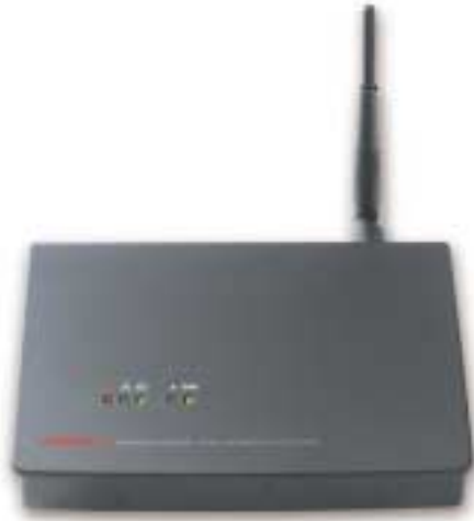
Model No. USR 012450