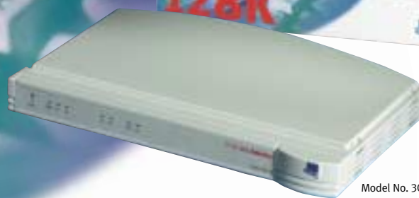
Model No. 3CD453469