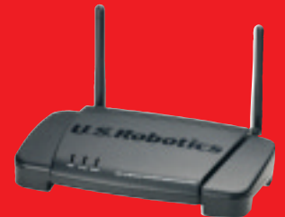
Wireless Turbo Multi-Function Access Point – Model USR805450