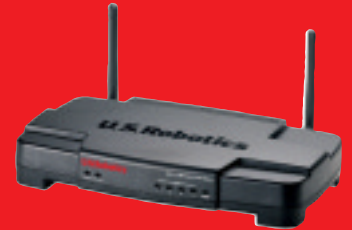
Wireless Turbo Access Point & Router – Model USR808054