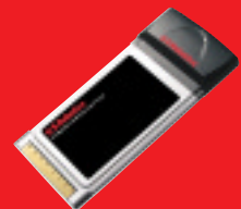
Wireless Turbo PC Card – Model USR805410