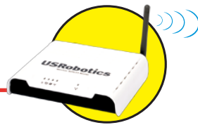
Model 9111 Wireless ADSL2+ Router