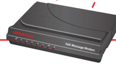
Model 5668D Message Modem