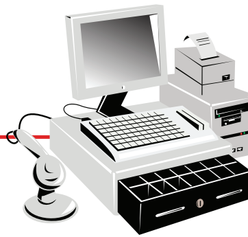
Point of Sale System