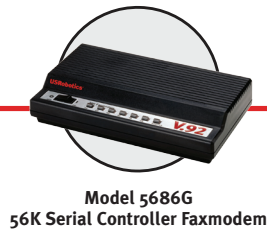
Model 5686G 56K Serial Controller Faxmodem