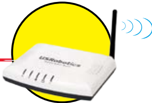
Model 9114 Wireless ADSL2+ Router