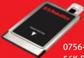
0756-XJ 56K PC Card Modem with XJACK® Connector