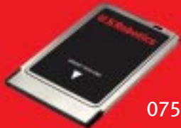
0756-CB 56K PC Card Modem