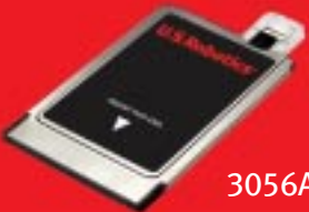
3056A 56K PC Card Winmodem with XJACK® Connector